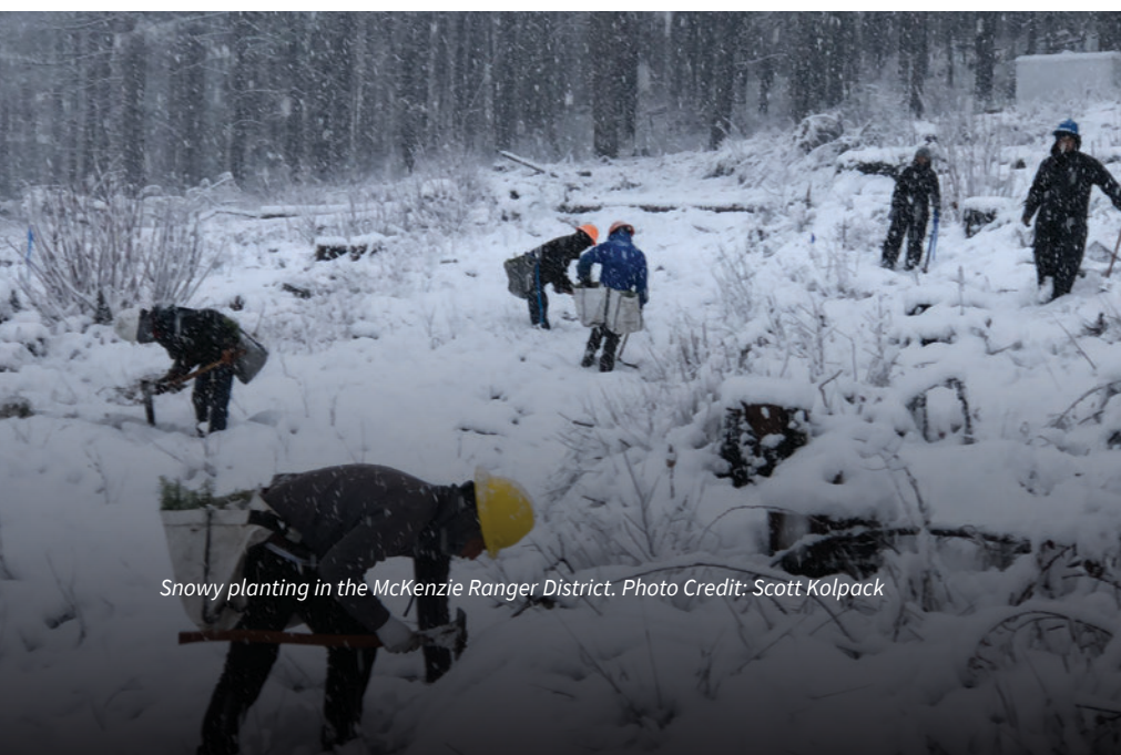
Snowy planting in the McKenzie Ranger District.

RS: This information will start being useful about five years after planting. Now, that's on the practical science level, defining the climate transfer distance. But in the interim, there are going to be other opportunities to provide useful information to move forward the idea of assisted population migration as a climate adaptation strategy for reforestation. I hope introducing the concept to a broad audience will build momentum for all of the steps to make assisted population migration operationally feasible. For example, how do people locate seed from other regions? And how do they get that seed to the nurseries? I hope our project and others serve as catalysts to address some of those questions. I would love to see something like a seed clearing house where there could be an inventory system where all landowners have access to seed that is appropriate for future conditions. It's going to take time, so the sooner we can get going on this, the better.