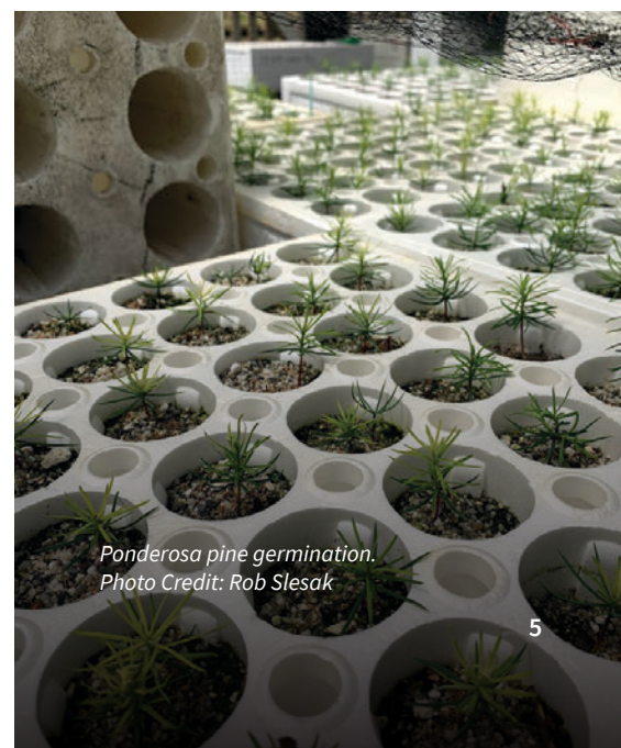
Ponderosa pine germination.